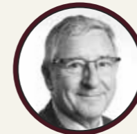
Vice-Chair Jim Fitzpatrick MP