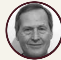
Secretary Lord Alan Howarth