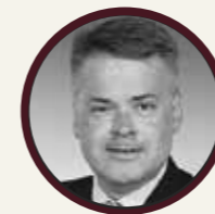
Co-Chair Tim Loughton MP